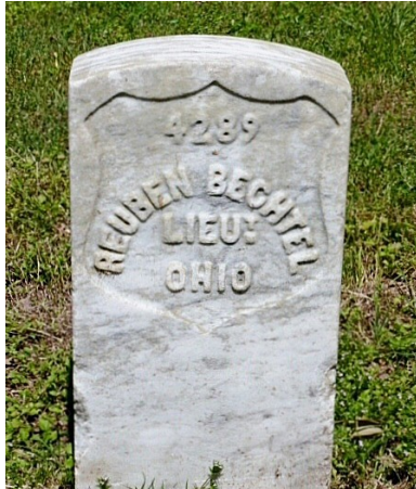
Vicksburg