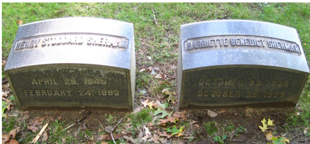
Cemetery

Relationship: Nephew of General William T. Sherman