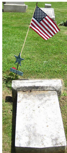
Photo Credits: drbuck at Find a Grave Fredericksburg East Cemetery. 2011

Condition of stone [right] June 2014. Photo Credit: Susie Holderfield