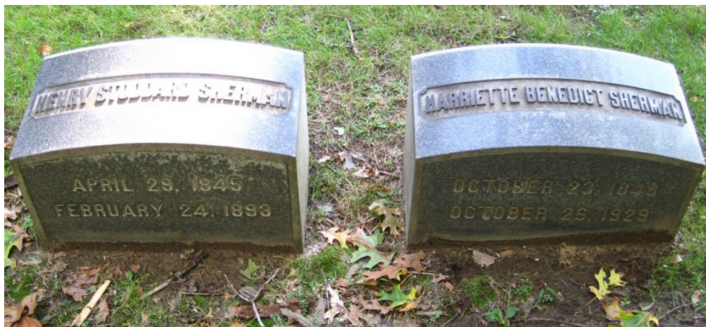
Cemetery

Relationship: Nephew of General William T. Sherman